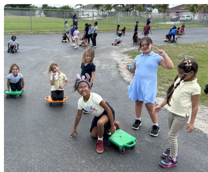
Scooters with Friends