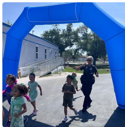
Finish with SRO Busch