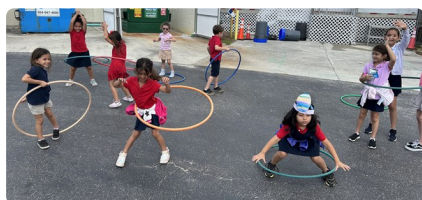
Hula Hoop Station

The End of Year LIVESCHOOL celebration is going to be an Inflatables Party. Students will need to save and cash in 400 pts to attend!